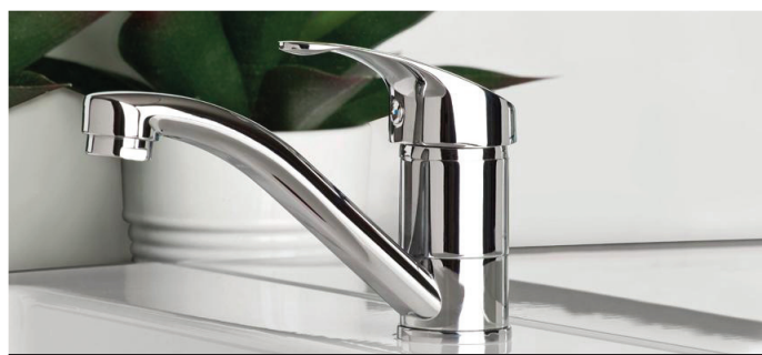
The Ivy Slimline Basin Mixer