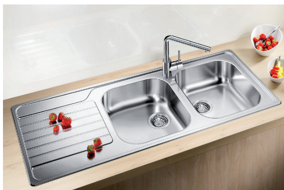
Blanco Dinas Kitchen Sink