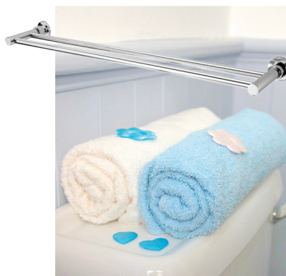
Gen X Double Towel Rail