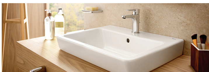
The Gap Basin