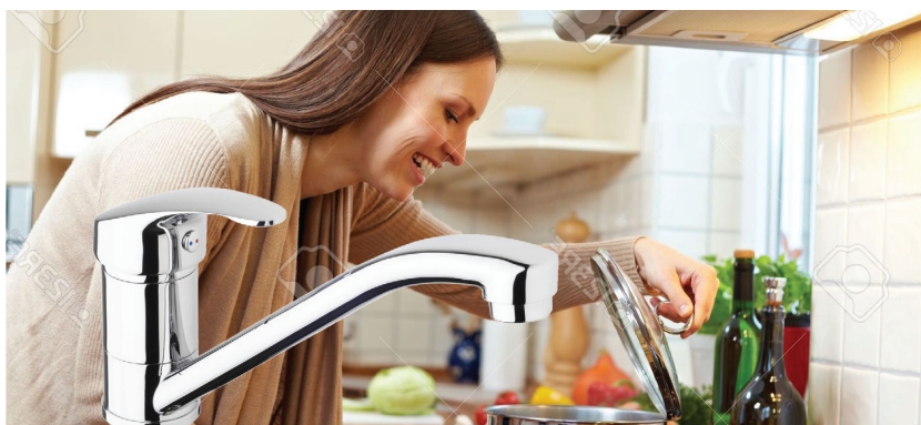
The Ivy Slimline Kitchen Tap