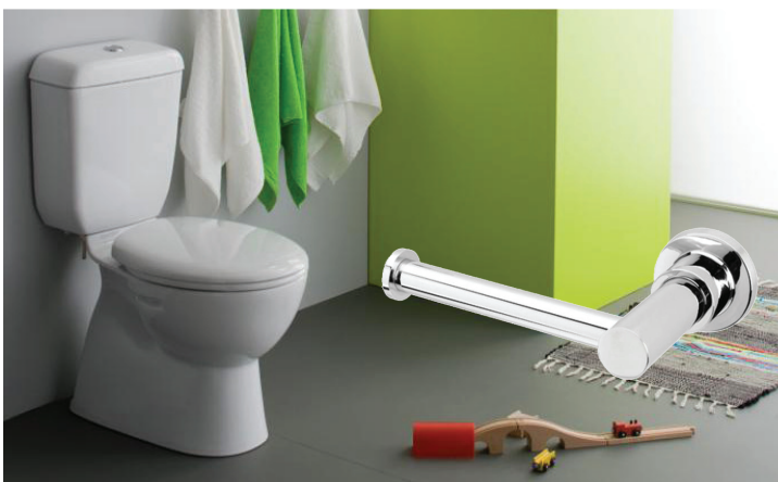
Posh Dominique Toilet Suite Gen X Toilet Roll Holder