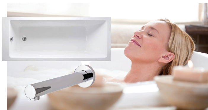
Base Acrylic Bath Suite Gen X Bath Spout